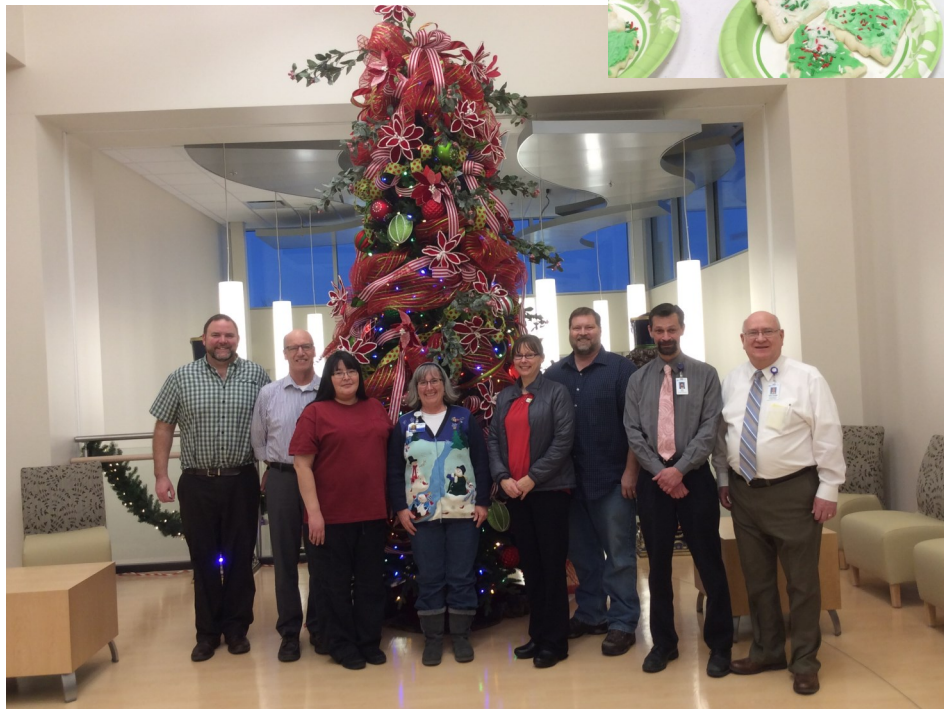
Happy Holidays from the Central Peninsula Hospital Steering Committee!