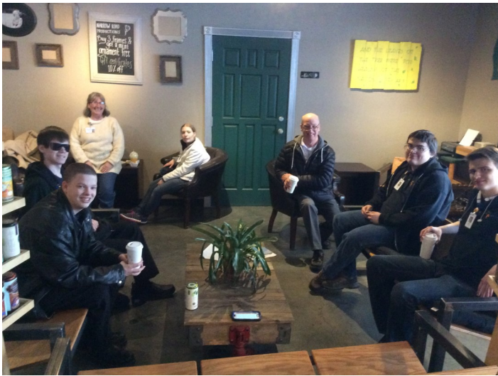
Hanging out at the coffee shop