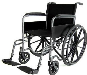
Professor X, played by Patrick Stewart in the movie, leads the X-Men and uses a wheelchair.

Based off of the Marvel comics series, X-Men takes place where mutants are a danger to the entire world and to the humans. A new mutant Logan (a.k.a. Wolverine) is taken to Professor Charles Xavier's School for Gifted Students. At the school we see Professor X, Storm, Cyclops, Gene, Rouge, and Ice Man as they try to defeat Magneto and his evil mutants