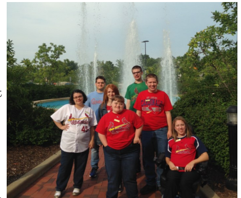
Project SEARCH intern class of 2016.

the international Project SEARCH conference. The program, formerly partnered with Barnes-Jewish St. Peters, was recognized for 100% Employment Outcomes for the intern class of 2014. Congratulations to those interns and all who worked to support them in meeting their employment goals.